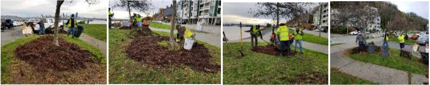
Tree rings mulched