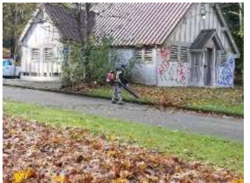
Occupied picnic shelters and structures