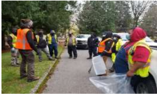
Removing garbage and litter