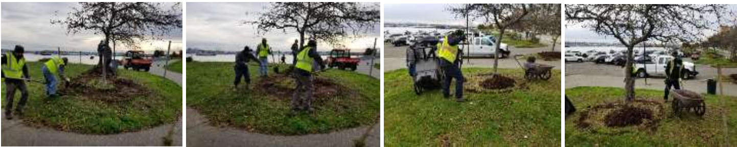
Adding mulch to rings